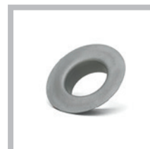
CB5907 1st Oversize