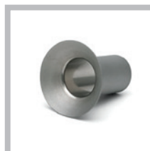
CB5906 1st Oversize