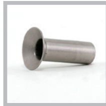
JK5546 2nd Oversize