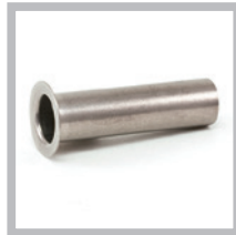
JK5501 1st Oversize