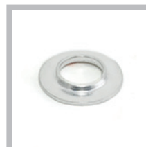
CB5947 2nd Oversize