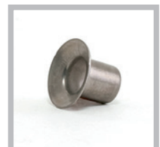
CB5948 2nd Oversize

©2020 Click Bond, Inc. All rights reserved. Click Bond and the stylized logo, ACRES, PANDOR, and BOLTMOD are trademarks, or registered trademarks, of Click Bond, Inc. Registered, U.S. Patent and Trademark Office.