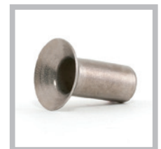
JK5726 2nd Oversize