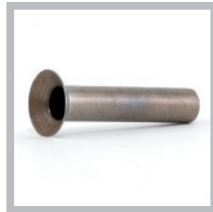
JK5506 1st Oversize