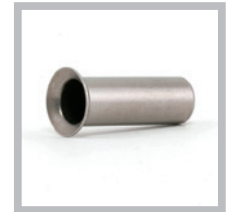
JK5542 2nd Oversize