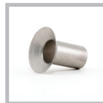
JK5706 1st Oversize