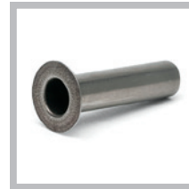
JK5507 1st Oversize