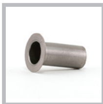
JK5701 1st Oversize