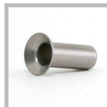
CB5946 2nd Oversize