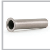
JK5541 2nd Oversize