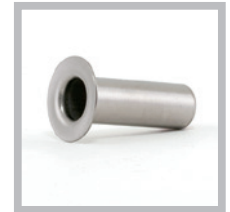
JK5547 2nd Oversize