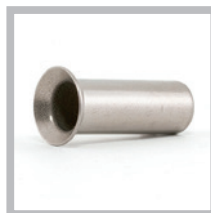
JK5722 2nd Oversize