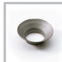
CB5908 1st Oversize