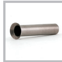
JK5502 1st Oversize